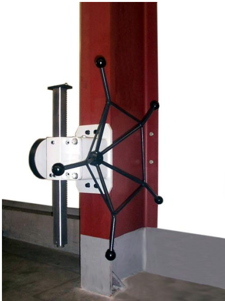
Broaching press T5 for fastening on wall or crane