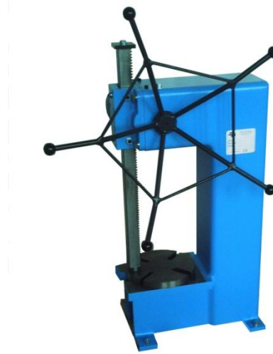
Broaching press T3 with special lacquer