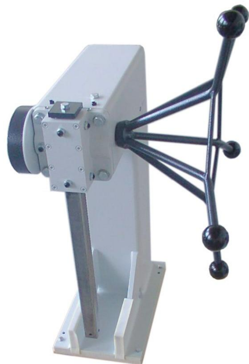
Broaching press T3 with special handwheel and special table