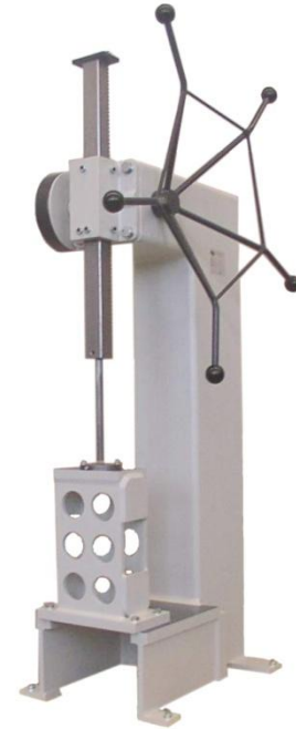
Broaching press T5 highly inside 1000mm with intermediate piece and special table