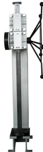
Broaching press T5 highly inside 1600mm with lengthening rack